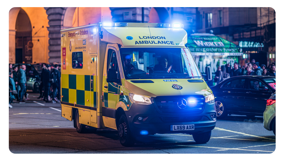
Some people work at night, like members of the emergency services.