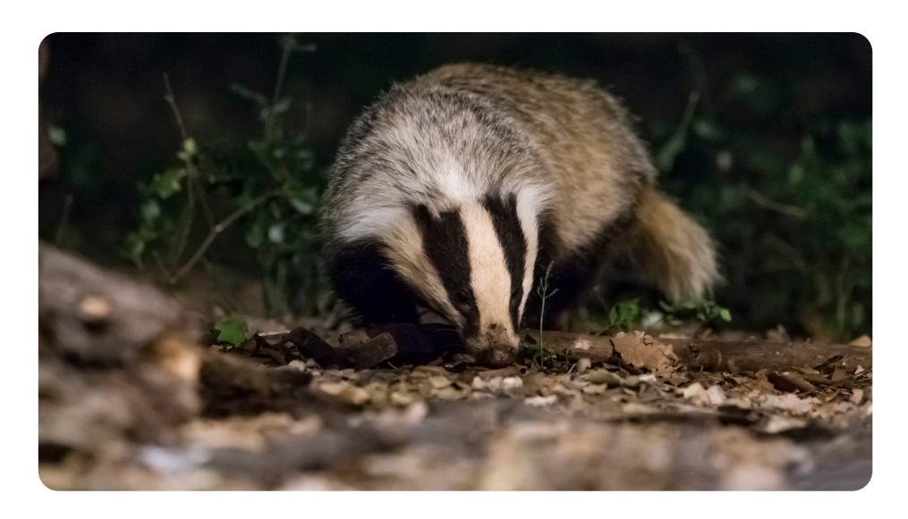
Bats, owls, foxes and badgers are nocturnal animals.