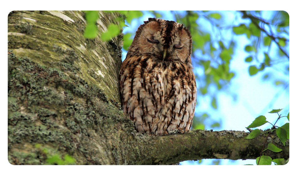
Some animals sleep in the day and are awake at night. They are known as nocturnal animals.