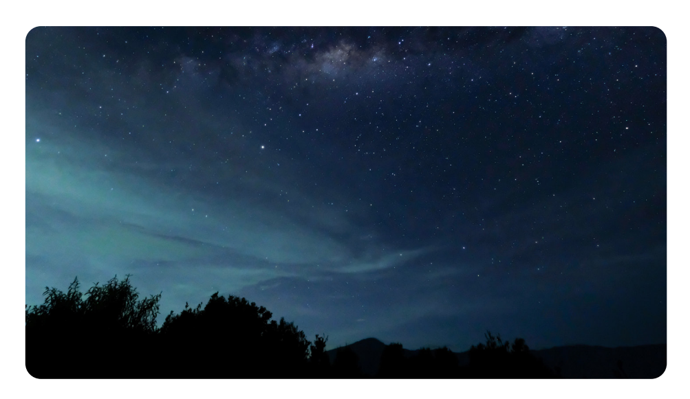
At night time it is dark. Most people sleep at night time.

Read these interesting facts about night time with a parent, carer or teacher.