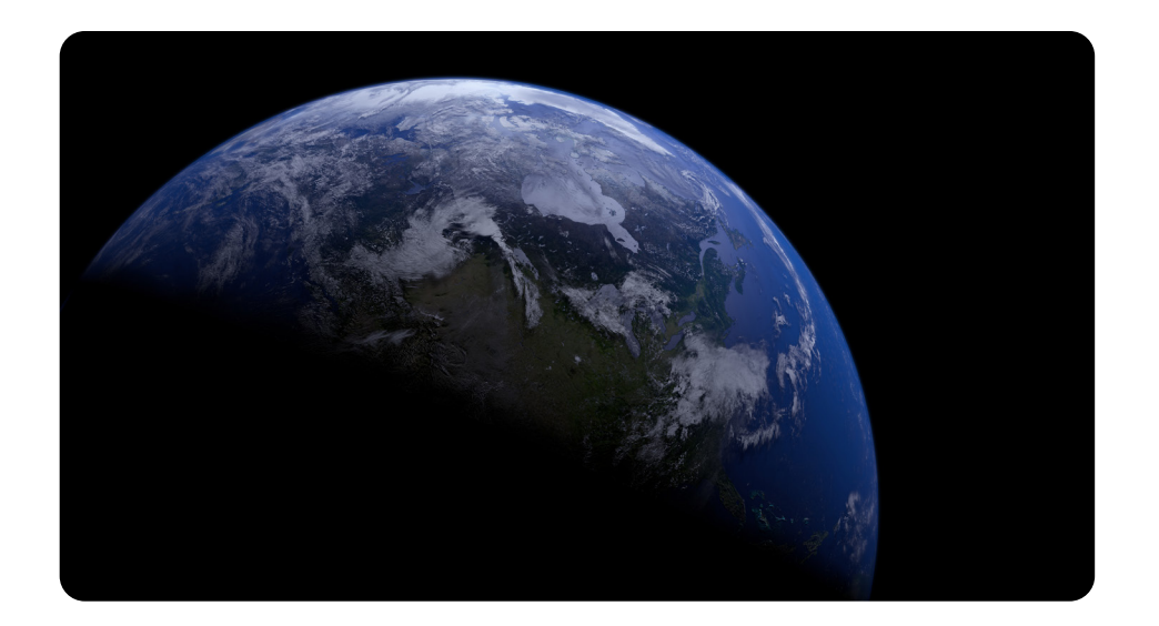
We live on a planet called Earth. It gets dark at night because our part of Earth is facing away from the Sun.