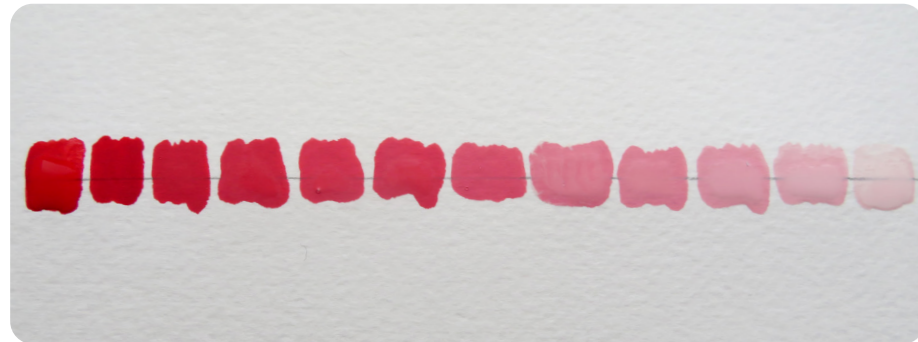
tints of red

A tint is a colour mixed with white. The more white paint that is added to the original colour, the lighter the tint. A tint can range from slightly lighter than the original colour, to almost white. When mixing a tint, begin with the pure colour and add white paint a tiny bit at a time.