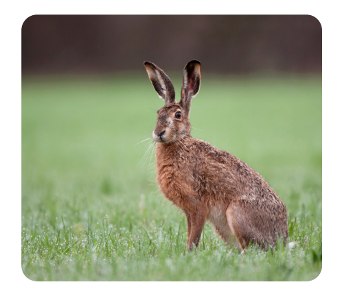
Animals have senses.

Animals are living things. They come in a wide variety of shapes and sizes. All animals are born, then they grow and change over time.