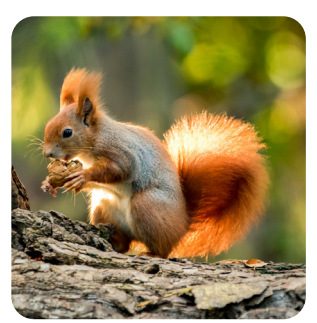
carnivores herbivores omnivores

A Venn diagram shows the relationship between two groups of things using overlapping circles.