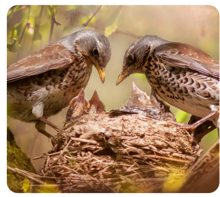
Animals have offspring.