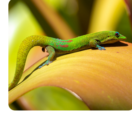
Animals get rid of waste.