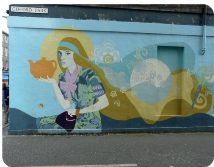
The Gifford Park mural by Kate George, 2015

A mural is a large picture that is usually painted onto a wall, ceiling or other structure.