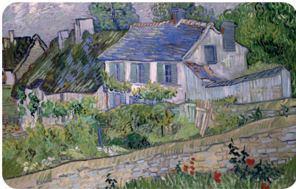
Houses at Auvers by Vincent van Gogh, 1890