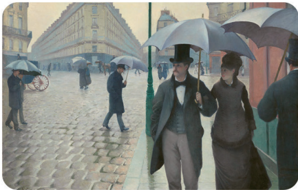
Paris Street; Rainy Day by Gustave Caillebotte, 1890