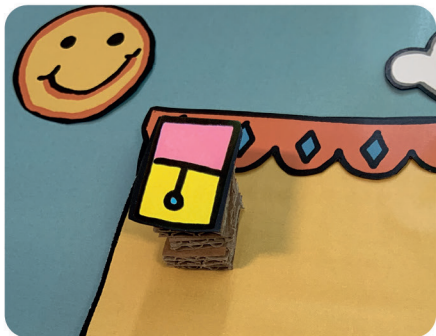
Five layers of cardboard make this window stand out.

Layers of corrugated cardboard can be glued to the back of cut outs to create a 3-D effect.