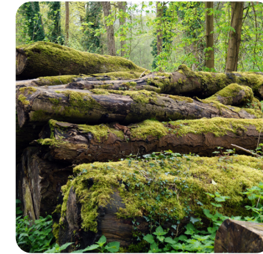
under logs and stones