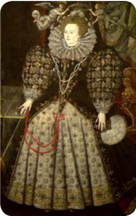
Portrait of Elizabeth I of England attributed to Nicholas Hilliard, 1590