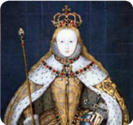
Coronation Portrait by unknown artist, c1600