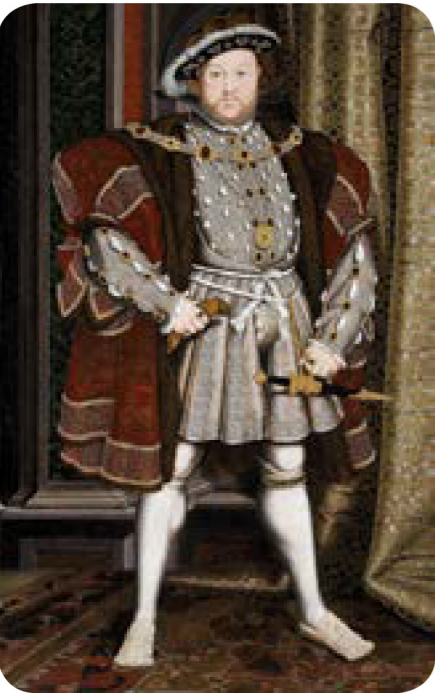
Henry VIII by Hans Holbein the Younger, 1537–47