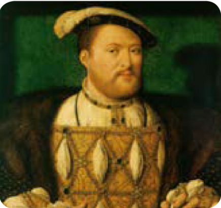
Portrait of Henry VIII by Joos van Cleve, c1530–1535

A portrait is a painting or photograph of a person. It usually shows their head and shoulders, but may show their whole body. Before cameras were invented, kings and queens often had official portraits painted to show how powerful and important they were.